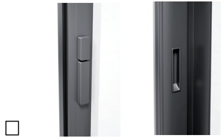
Without profile cylinder, turning knob inside, push handle inside, with shell handle outside